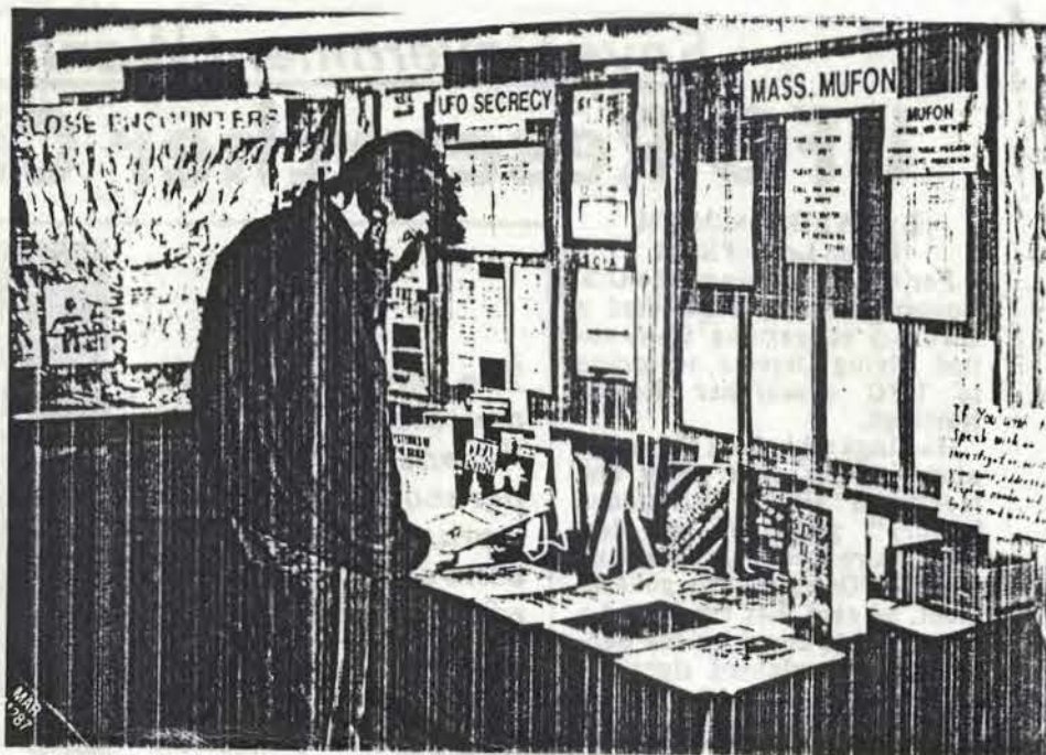
MASS. MUFON LIBRARY EXHIBIT

46 The Boston Globe Monday, Mar. 16, 1987